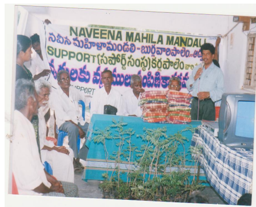
Cloths Distribution to Older