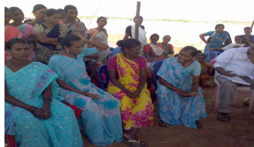
Mandal level meetings

constitute to the children. If any body violet this they should be punished. This massage brings to the parents, owner and other public and asked to protect the child rights.