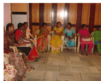
SUPPORT Near Masjid, Old Muslim village,KARLAPALEM-522 111,Guntur District